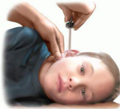
Children 3 years old and younger

Ask your healthcare provider or pharmacist if you should wear gloves when you give ear medicine.