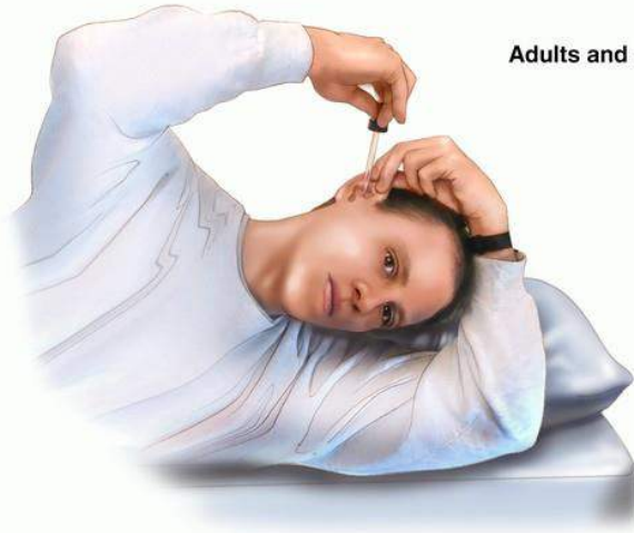
Adults and children over 3